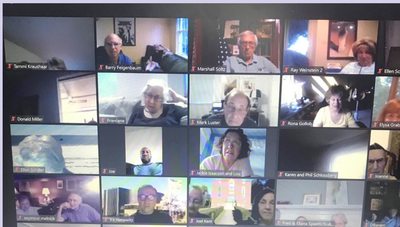
A screenshot of the virtual Emanuel annual meeting.