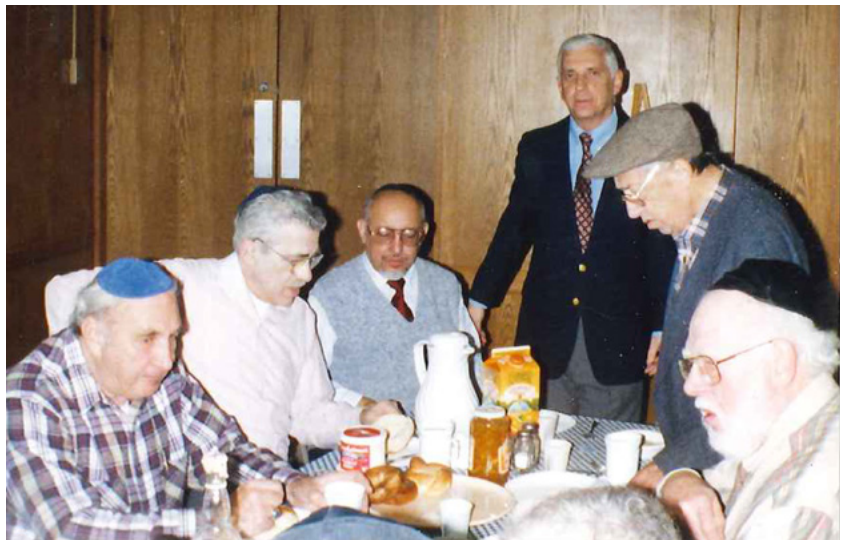
A daily after minyan breakfast in 1997.