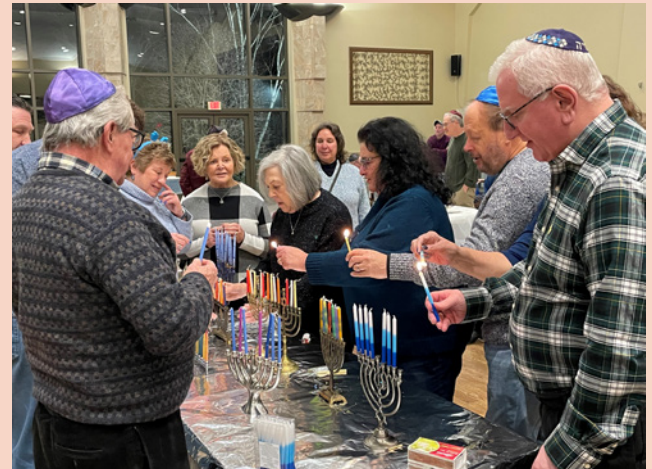
It was cold outside but inside the Emanuel auditorium the light of the Hanukkah candles and delicious latkes and other foods warmed the group that enjoyed a fun night out on the 7th night of Hanukkah. A great time was had by all!