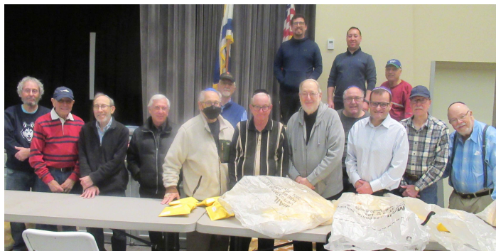
Members of the Brotherhood gathered to prepare the Yellow Candles for mailing to the entire congregation.