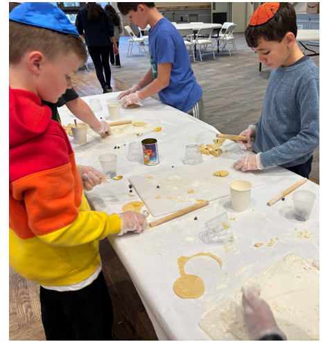
Religious School students made Hamantaschen on March 5, 2025!

Weinstein Mortuary announced the funeral home will accept religious items and dispose and bury them properly and reverently.