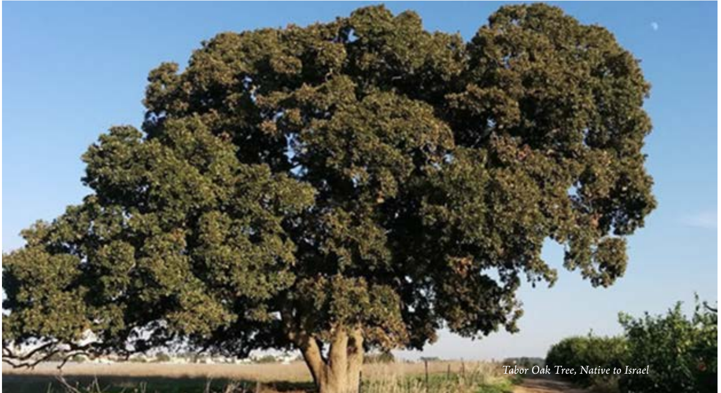
Tabor Oak Tree, Native to Israel