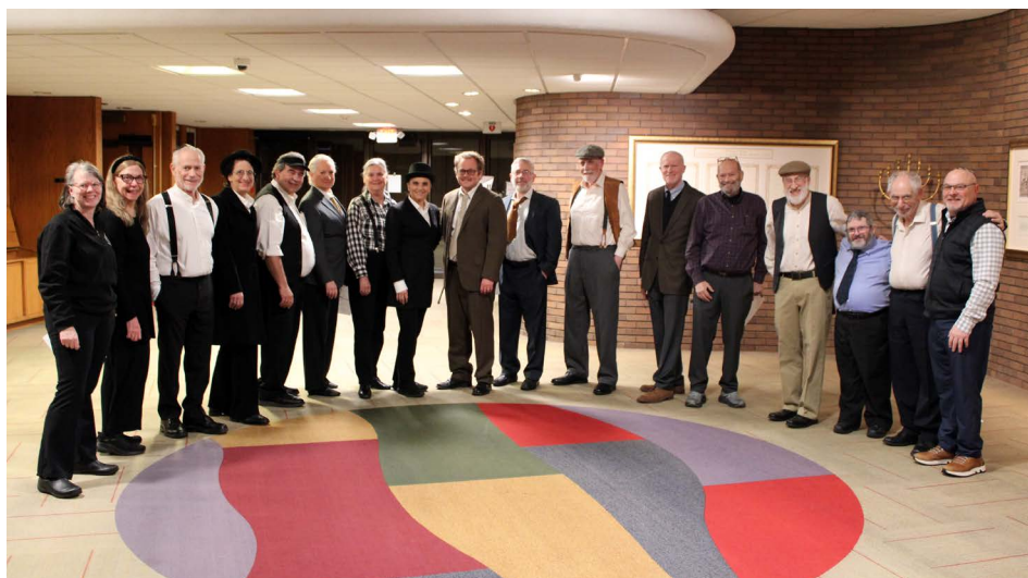
The Forward! cast and crew posed for a group photo prior to their performance.