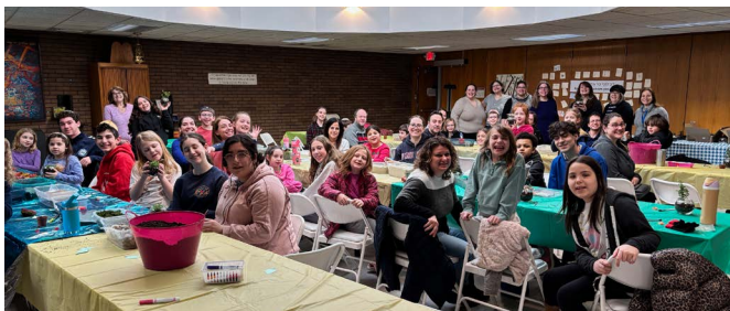
Participants created Terrariums at Sisterhood's Tu B'Shevat Program

Moments like these show the power of showing up for our synagogue, for one another, and for ourselves.